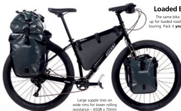
Large supple tires on wide rims for lower rolling resistance – 650B x 70mm

The same bike but set up for loaded road/gravel touring. Pack it your way.