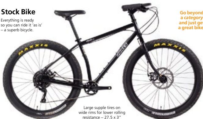
Large supple tires on wide rims for lower rolling resistance – 27.5 x 3”

Everything is ready so you can ride it ‘as is’ – a superb bicycle.